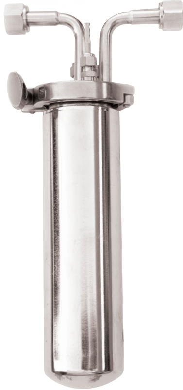
SGH Stainless Steel Gas Heater