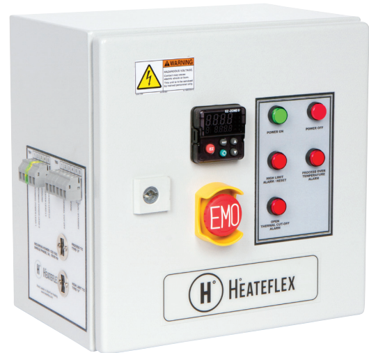
Temperature Controls in Compact Enclosure