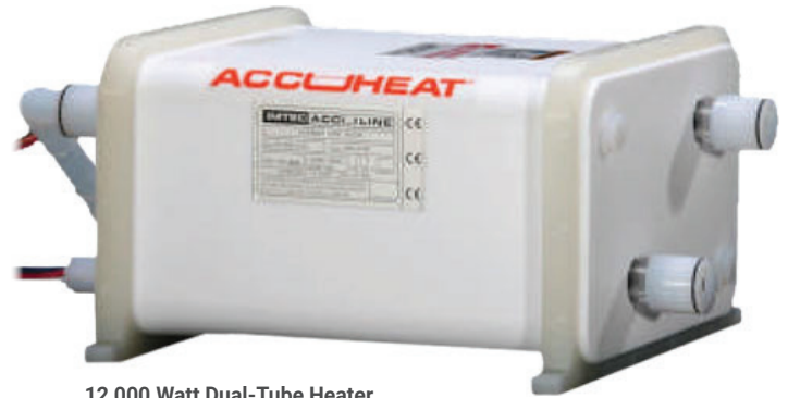
12,000 Watt Dual-Tube Heater

Accuheat® quartz in-line heaters feature ultrapure quartz tubes, wrapped in an Inconel® heater element for uniform conductive heat transfer to the process fluid. Semiconductor-grade quartz fluid path allows for high performance with almost any chemistry. Housings constructed of PTFE offer chemical resistance and low surface temperature. Alumina Silica insulation is tightly packed to minimize heat loss. Additional temperature sensors and leak detection devices ensure safe and efficient heating. All heaters include a well-mounted RTD, 2 J-type thermocouples, and a self-resetting thermostatic snap switch. They do not require cooling or purging that is typically needed for I/R lamp heaters. Imtec's conductivity strip is also included for early detection of internal leaks. The heaters may be mounted either horizontally or vertically.