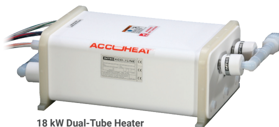
18 kW Dual-Tube Heater