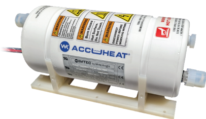
4.5 kW Single-Tube Heater

Accuheat® power modulator technology ensures minimal heat-up times and efficient use of energy for any application. During heat-up, the heat transfer rate gradually decreases until the power modulator turns off the heater. Heat built up in the quartz is then dispersed into the liquid. This conserves energy and minimizes stress on components caused by over-heating. Power Modulators must be used as part of the control system.